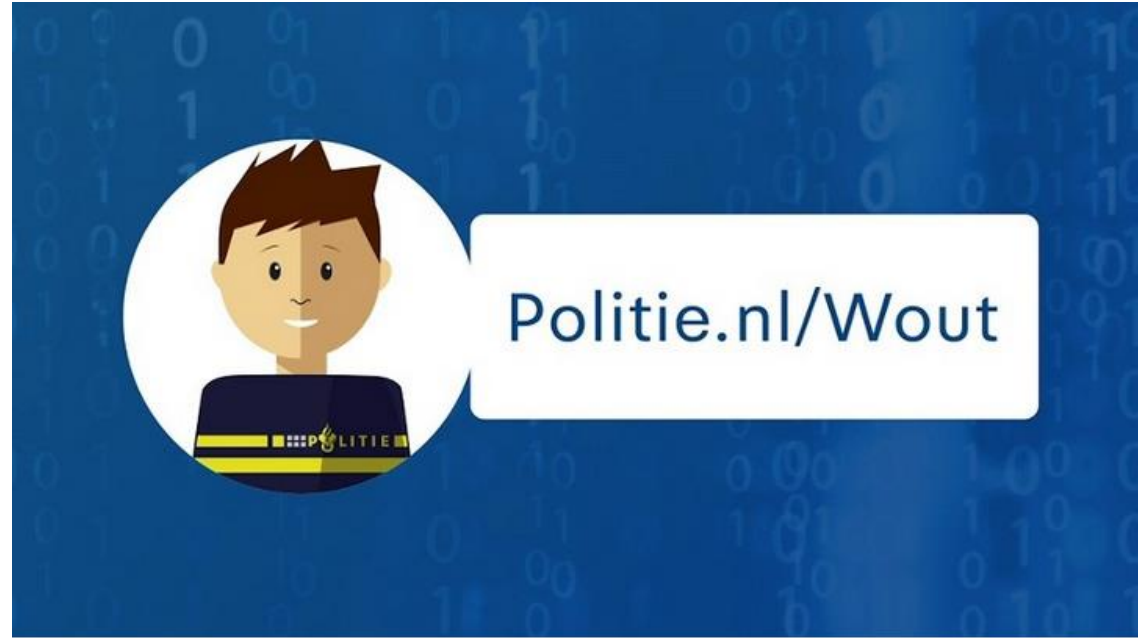
cyber resilience for citizens and SMEs